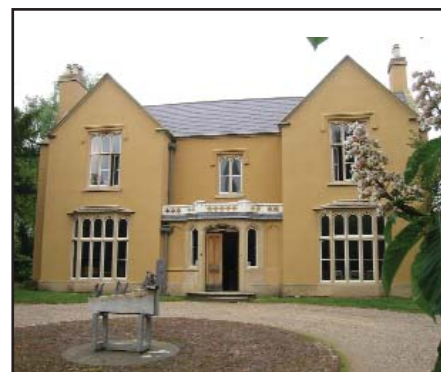
A Quiet Space in the Heart of Southwell